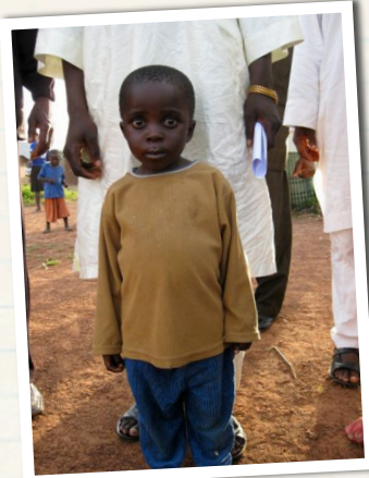
Future Sports Minister in Nigeria!